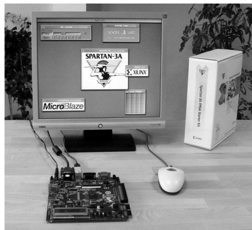
Fig. 3: The Genode FX GUI toolkit

This video input enables the use of the device in live video mixing and transformation applications.